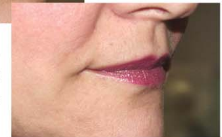
Lips After Permanent Cosmetic