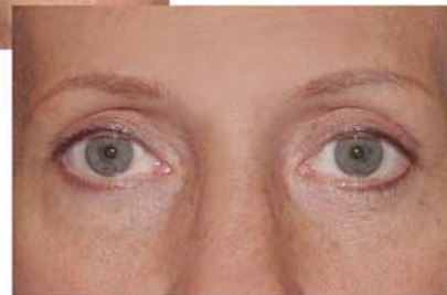
Eyebrows After Permanent Cosmetic