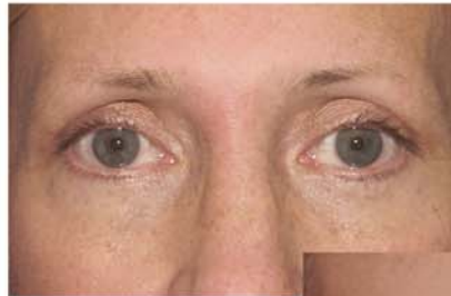
Eyebrows Before Permanent Cosmetic

Permanent Cosmetics will add fullness and definition to thin or sparse eyebrows.