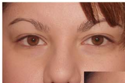
Eyelids Before Permanent Cosmetic

Permanent eyeliner will give a soft and subtle appearance to enhance and brighten eyes.