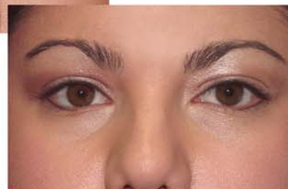
Eyelids After Permanent Cosmetic