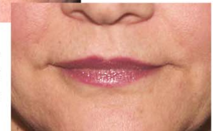
Lips After Permanent Cosmetic