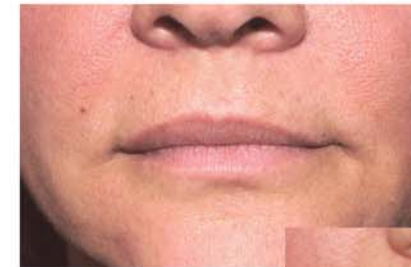
Lips Before Permanent Cosmetic

Pigmentation of the lips helps restore color and definition which gives a more youthful appearance.