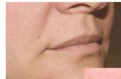
Lips Before Permanent Cosmetic